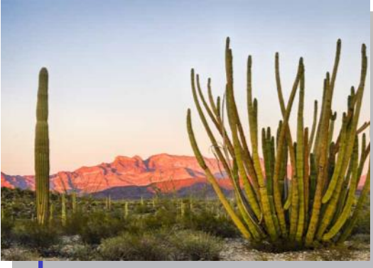
Adv: Vicki Braunagel "Organ Pipe Cactus at Sunset"

The February meeting was cancelled due to snow. Some sample pictures are shown below (choosing was difficult, as there were so many great pictures!). To see all of the December results, plus important club information and other cool stuff, go to our website at www.go-svps.org .