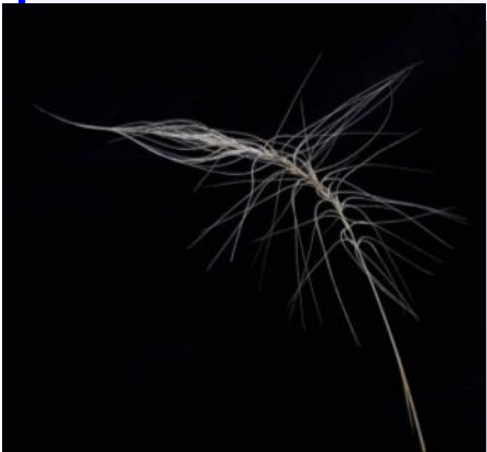
Adv: Kamen Guentchev "The Plant"