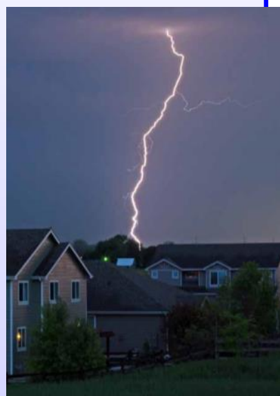
Adv: Phil Samblanet "Out The Back Door"