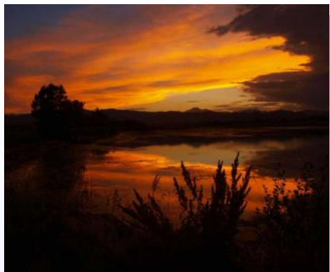
Adv : John Roper "Evening Fire"

Photos were Show and Tell . Some sample pictures are shown below (choosing was difficult, as there were so many great pictures!). To see all of the June results, plus important club information and other cool stuff, go to our website at < www.go-svps.org >.