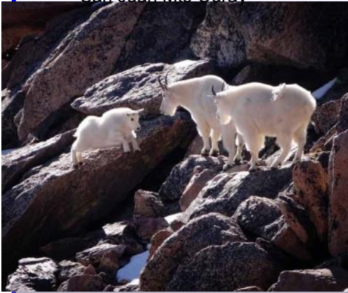
Beg/Int: Rosemary Cook "No Goat Left Behind"