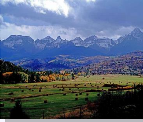
Adv : David Mowrer "San Juan Mts Ouray"

Photos were Judged . Some sample pictures are shown below (choosing was difficult, as there were so many great pictures!). To see all of the June results, plus important club information and other cool stuff, go to our website at < www.go-svps.org >.