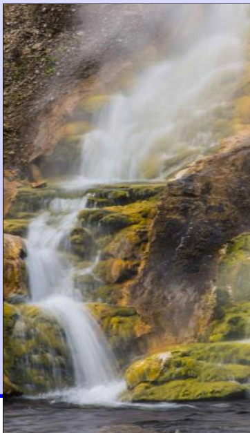
Adv : Jack Cornils "Falling Water"