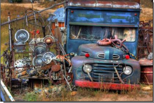
Adv : Craig MacCambridge "Ward-CO"

Photos were Judged . Some sample pictures are shown below (choosing was difficult, as there were so many great pictures!). To see all of the February results, plus important club information and other cool stuff, go to our website at < www.go-svps.org >.